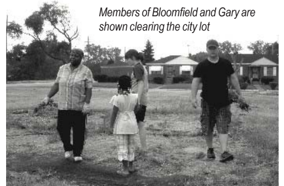
Members of Bloomfield and Gary are shown clearing the city lot

Bloomfield FBC joined Gary FBC for an exciting weekend in Gary recently. The weekend consisted of work days and Youth-Led services. Thirty-six bags of trash and a truck load of brush were cleared from a city lot. As new friends were made while working, prayers were offered that the group's example of service would make a difference to passers-bys. It is the hope of Bloomfield FBC and Gary FBC that this lot might become a soccer field, or a park with swings, slides, and a skate boarding area. While these hopes may not come to fruition directly, it was seen that it is still possible to dream of something better, and working together can make it happen. Work was also done at church members'