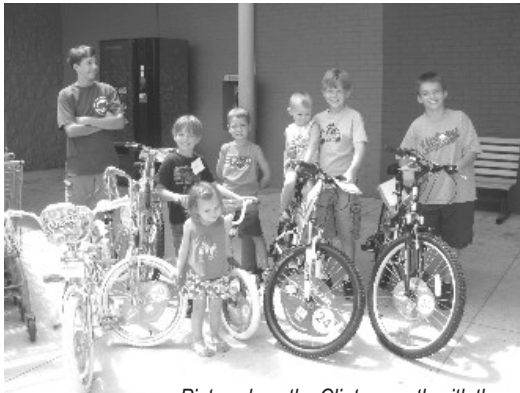
Pictured are the Clinton youth with the bikes they helped to purchase

This spring the youth Sunday school classes of Clinton FBC participated in the Penny Project, collecting over $600. The children decided they wanted to help local children who live in poverty and with the help of the local Kid Kare Project, 6 local children were identified with June birthdays. The children did not have bicycles. The youth of Clinton FBC purchased six bicycles that were given to the children as a birthday gift. One of the children is a young teen who had just started a paper route and he was truly thrilled to have a bike to help with his route. This inspired