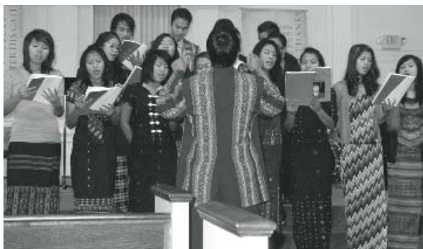
The Zophei Christian Church youth choir prepared the crowd to hear the scriptures and the message.