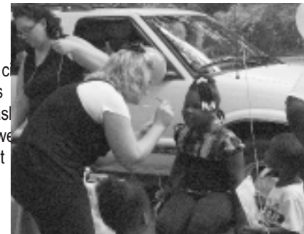
The kids loved having their faces painted!

Mounds has held back-to-school rallies in the past with free games and food, but on a much smaller scale. This was the first year to give away school supplies and the first year to partner with Anderson Community