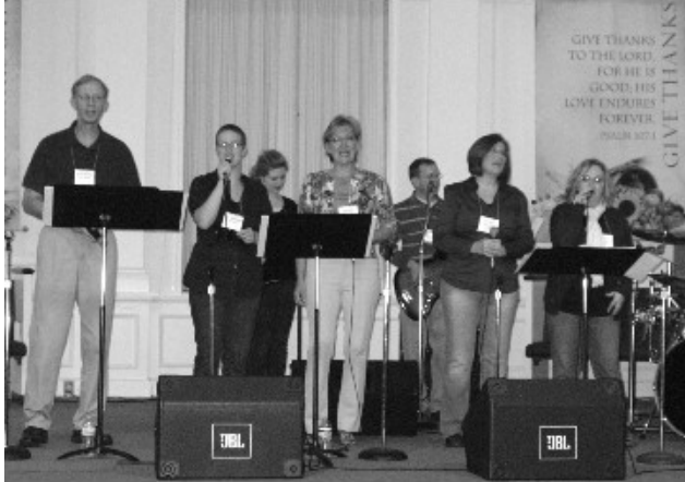
The Plainfield FBC praise team welcomed the worshippers with singing.