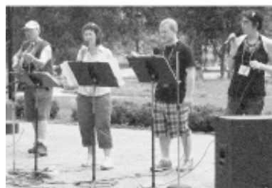
The Mounds BC praise band added a festive atmosphere to the Shadyside Park in Anderson.

Several local businesses put up booths on the grounds of the park and auctions of donated items were held. Ten percent of the vendors' sales and all proceeds of the auctions will go to support school programs promoting positive behavior.