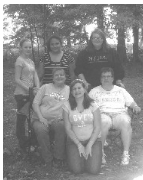
Exploration Acres Event.