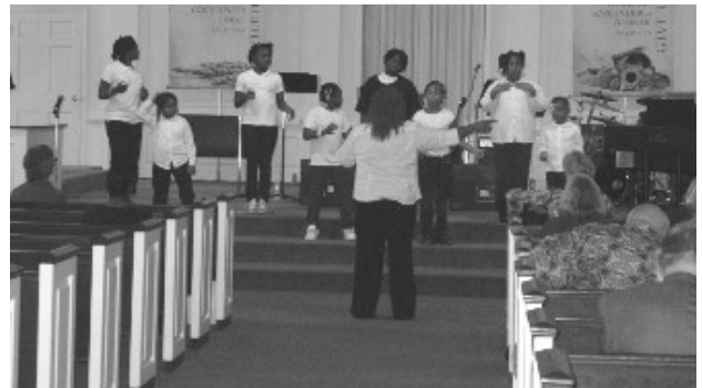
The Edna Martin Christian Center children’s choir brought everyone back together for closing worship.