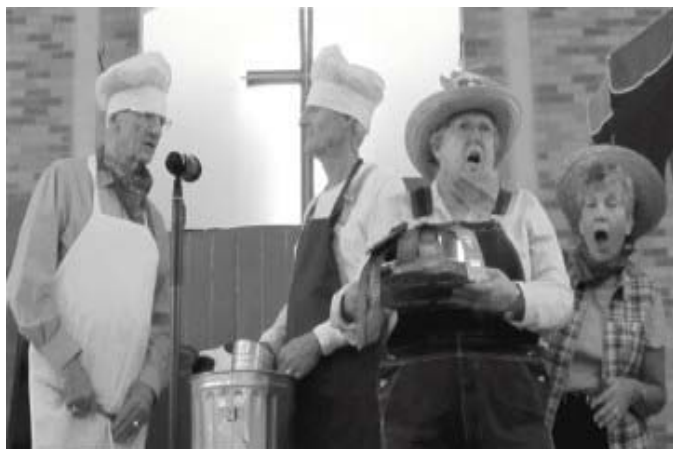
"Lasting Impressions" sing their way through the State Fair!

All who attended went home with the feeling that the day was well spent and filled with thoughts of anticipation for the next Senior Adult Day to be hosted by the Crawfordsville FBC on Thursday, April 12, 2012.