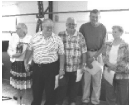
Pictured are those who have served with the Fire Department

On Sunday, September 11, 2011, the town of Amo along with the community churches - Amo Friends, Amo FB, and the United Methodist Church of Amo held a 9/11 lunch and Service of Remembrance. First Responders, which included Fire Department personnel, Law Enforcement officers, active Military and Veterans, were honored. Each person honored was given a certificate of appreciation as well as a small patriotic bag with some mementos and treats. The congregation of Amo FBC feels blessed by the town's First Responders and Military, both active and Veterans! Pastors representing the churches participated in the service by reminding those present of some of the events of 9/11 and giving words of hope and inspiration. A community choir sang GOD BLESS THE USA and a solo