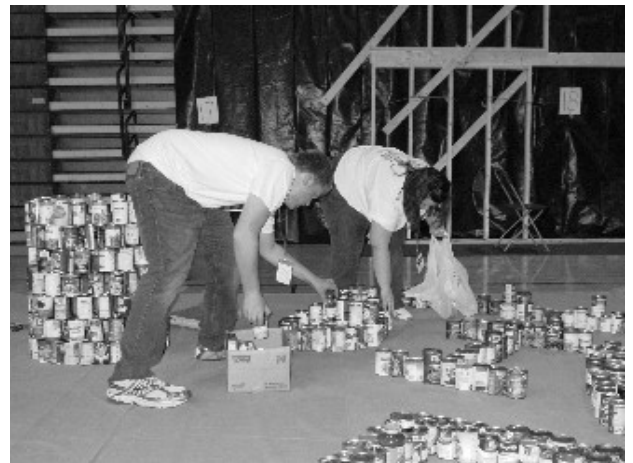
Board members unpack and stack canned goods.