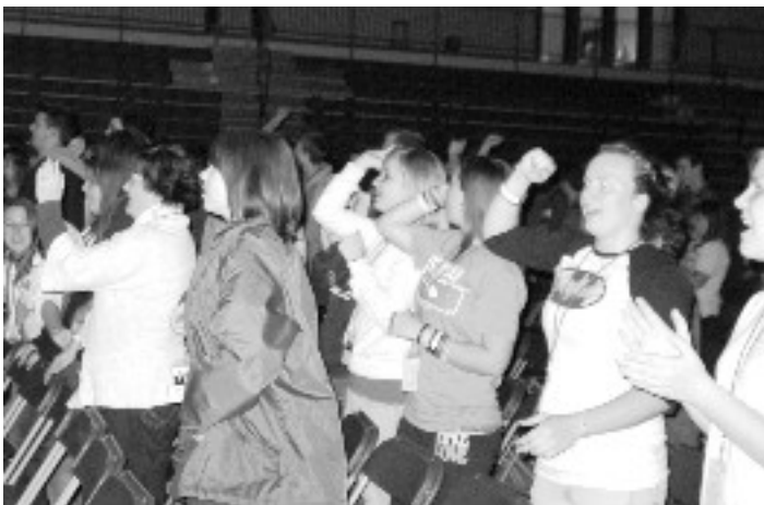
Worship was quite lively!

Visit www.abc-indiana.org/region-ministries/american-baptist-youth/ to view more pictures.