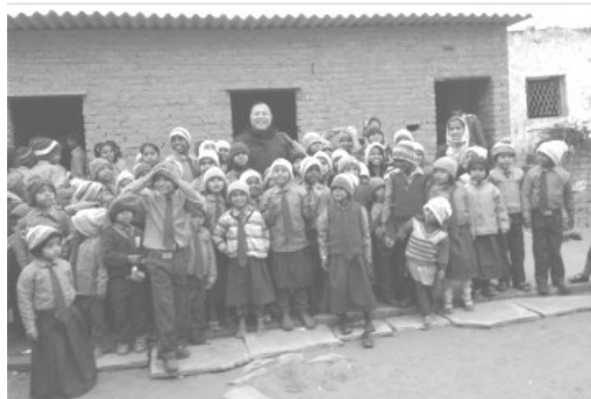
Children in their uniforms stand outside the new school in a Delhi slum

In December of 2013, twelve people from Ft. Wayne BC journeyed to New Delhi, India on a mission trip. In the twenty months since that trip, much has been accomplished to specifically help with a school in one of the slums. A three room brick school building has been built to replace the one crowded room that was being used before. School uniforms have been purchased for 100 students. Monthly financial aid is being sent to the pastor and his assistants as they work in the school and the Delhi Community Church. A