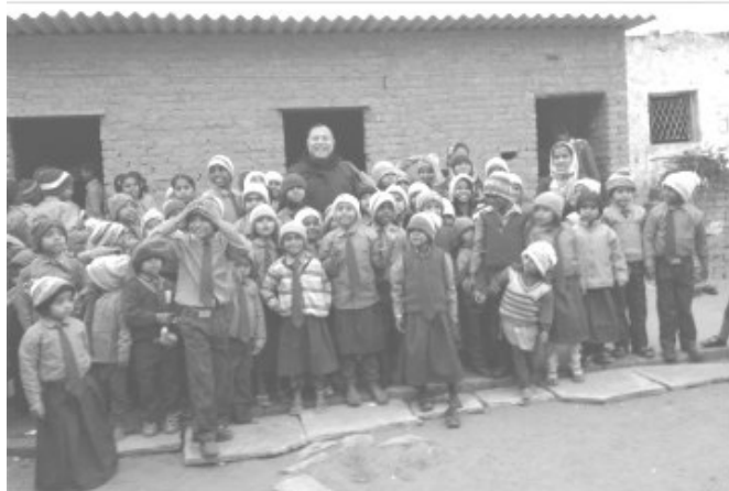
Children in their uniforms stand outside the new school in a Delhi slum

In December of 2013, twelve people from Ft. Wayne BC journeyed to New Delhi, India on a mission trip. In the twenty months since that trip, much has been accomplished to specifically help with a school in one of the slums. A three room brick school building has been built to replace the one crowded room that was being used before. School uniforms have been purchased for 100 students. Monthly financial aid is being sent to the pastor and his assistants as they work in the school and the Delhi Community Church. A