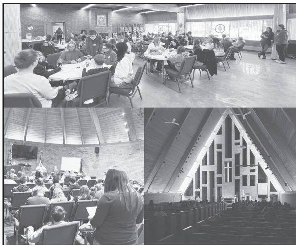
Photo from Jan. 2024 FUSE at Columbus FBC

ABY Convention - Save the dates! Nov. 8 & 9, 2024, 6th-12th graders hosted by New Castle FBC