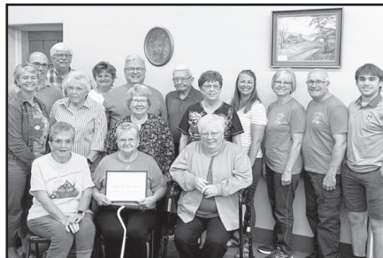
Warren FBC received the Samuel Jones Community Service Award during Salamonie Summer Festival 2023.