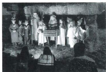
Above: Westport BC puts on a Live Nativity as another way to reach out to the community.

Westport BC started small, special interest groups that are open to the community and designed to be what they call, "side door" ministries to help their surrounding community get to know people from their congregation. Examples of what they have offered recently have been a book club, cooking class, aeronautical club (aka rocket building) and a mom's brunch group.