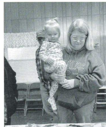
Above: Several ages represented at Mt. Moriah BC Fall events.

While many who attended the event were not from the local area and were often related to people already in the church, at least smiles were exchanged and spirits lifted! The church also continued their involvement in an annual Trunk or Treat; but, instead of simply handing out the usual candy, this year (while following Covid-guidelines and masking up), they purposefully brought kids inside the church building to receive free pairs of mittens or gloves and scarves, a simple act of kindness that seemed appreciated by the children's parents, and it was a nice way to show what it means to "be" the church!