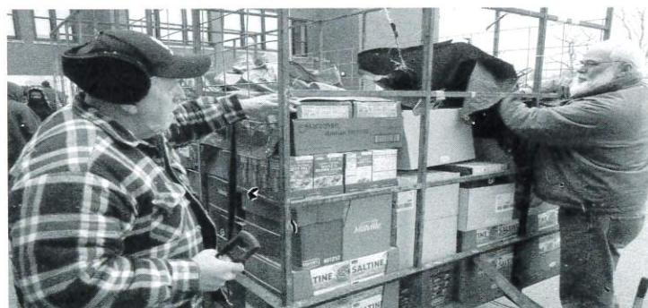
Above: Two Coffee Creek Association volunteers at EMCC.